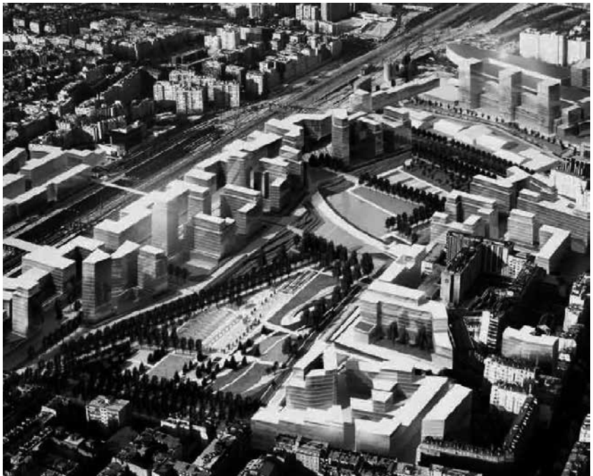
Fig. 3 – Birdseye view of the urban project before the Court tower was added to the North of the area.