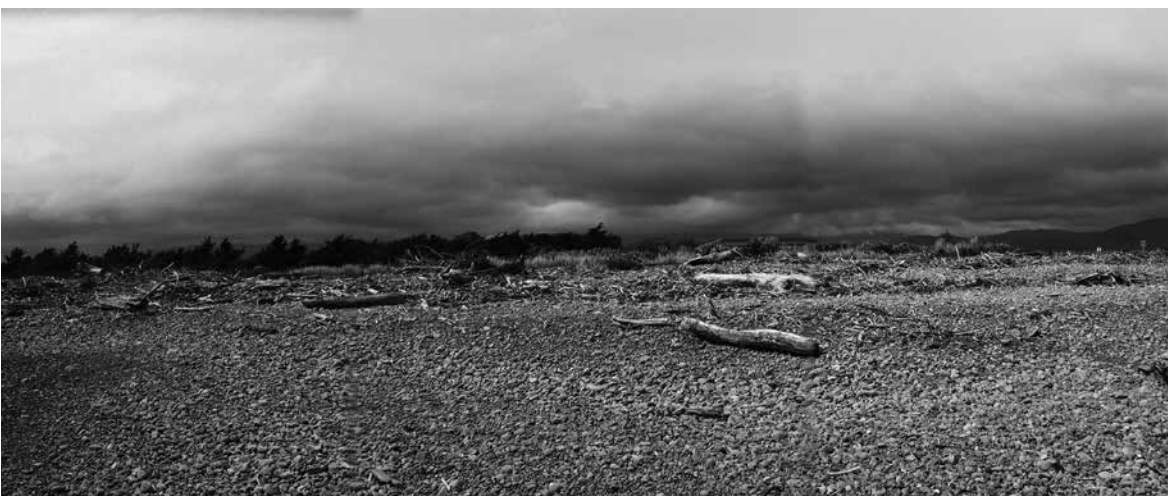
Fig. 1 - Site (2013); image courtesy of Twose.

The extended time frame meant, for example, that the hiccups in the 3-D printer (which will be subsequently discussed) were resolved, rather than finding a simpler and more productive solution to the problem. Thus, the project is embedded with an institutional temporalization which differs from an architectural project whose rationalisation is defined by contracts and a brief.