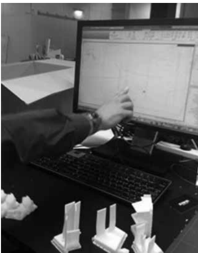
Fig. 4 - Design discussions/ gestures series (2014); image, Smitheram.

The variations in the 3-D models had produced a number of results, which enabled us to discuss what these models contribute in terms of the design of the installation wall. Twose started to sort the models into groups which were successful. Success was also bound to the imagined (full scale) exhibition – and how it operated to “orientate” people positively towards the wall (Ahmed, 2010). In discussion of what makes the printed models successful, Twose describes the moment he moves forward with one model over the series of others – as ‘it felt right. He talked about how it resonated with him; we discussed a general sense of rightness at this stage in terms of the charge held by the model, rather than how it met the criteria or how one could consider this as a type of knowing held within the body due to experience (Ammon, 2017). But of note, he picked up a model, held it close and rotated it – he would also distance himself from the models and engage in a lengthy discussion about its role, there was a continuous movement between engagement and somewhat disengaged approach to the model (we all did this to different degrees) (Fig. 4).