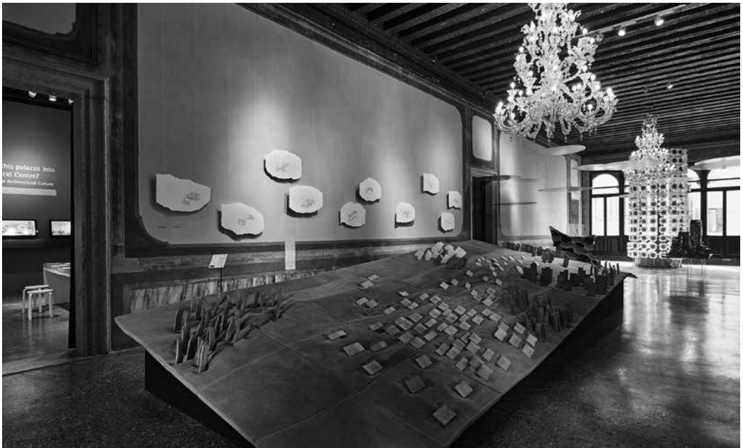
Fig. 6 - Installation Venice (2016)

forms the role of an ‘architect.’ His work resonates to an extent with Yarrow and Jones’s (2014) observations when they explore the notion of detached-engagement, although their research is in terms of an established craft, specifically masonry. They situate their research as a counterpoint to existing work on craft “which assumes an antipathy between detached and engaged relations”; instead what they show is “how they are necessarily mutually implicated” (ivi, p. 272). Thus they acknowledge that craft requires a “cultivated self that acknowledges subjective thoughts and individuated actions, but deliberately seeks to regulate these through the embodiment of traditional rules, procedures, skills, and personal characteristics” (ivi, p. 272). However, they also distinguish this from alienation – in particular, a desire to “create an artefact that indexes individual creativity” (ivi, p. 272). In contrast, through the observation of Twose’s work, and as already alluded to, the performance of ‘being’ an architect plays in and through an understanding of individual creativity, which orientates the human and non-human working party. Thus we start to consider the impact of identity whose performance is tied to normative prescriptions which guide behaviour; and clearly at times, to exercise coercive authority. This is important for engagement and detachment are