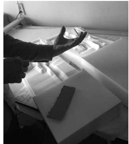
Fig. 5 -Design discussions/ gestures (2014); image Smitheram.