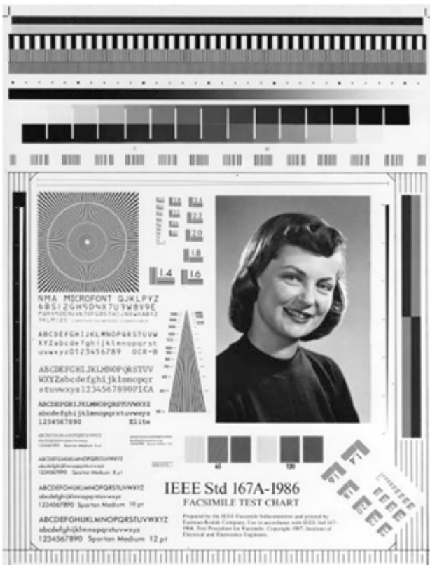
Fig. 5 - CCITT fax test chart 167A, 1986.

The construction of a faxable document also relied on a few devices designed to spell out the terms of the transmission process.