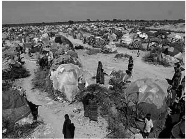
Fig. 3 – Ifo Camp, Dadaab, Kenya, 1992.

Construction of such knowledge might have been the work of experts and thinkers outside conventionally understood epistemic frameworks.