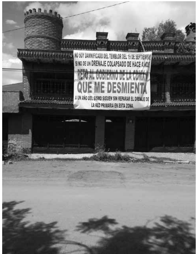
Fig. 4 - "I am not a victim of the September 19th earthquake, but rather of a years long collapsed swage system. I dare the government to prove me wrong".

inhibit street and walkway mobility in and around the neighborhood and further isolate the already marginalized community. According to official figures, in the 2017 earthquake over 5,000 houses were damaged in the 2017 earthquake in Colonia del Mar alone. Of these damaged homes, 1,200 have been declared inhabitable. In addition to the structural damage, 38 grietas were counted in the streets of the neighborhood (Ahedo, 2017). Crime has also increased in proportion to the damage, and people are living in dangerously compromised structures and rebuilding with dangerous or seismically vulnerable materials. Colonia del Mar, like much of Tláhuac, has not yet started a meaningful recovery process despite extensive damage to homes and infrastructure in the alcaldía. The immediate response by officials was poor all over the city, but was especially lacking in these peripheral communities.