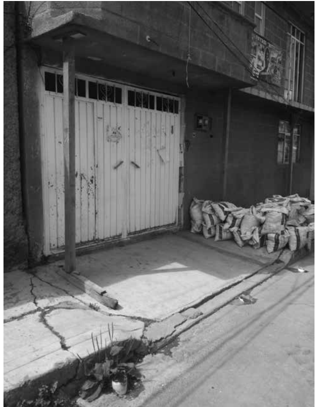
Fig. 2 - Damaged house supported by wood formwork a year after the earth- quake.

Mexico City, Tláhuac was subjected to a rapid urbanization period despite its unstable soil conditions. What was once farmland was subdivided into 3200 200 sq meter plots of land intended for development, and poor migrants from Michoacán, Oaxaca, Guerrero, and Jalisco began to populate the area, where they found work, raised families, and built community. Colonia del Mar is a small neighborhood established in an especially marshy part of Tláhuac. According to informal accounts, the colonia was briefly considered as a potential site for an amusement park by a Japanese organization. However, the soil conditions were declared so unstable that the project was canceled. If this story is accurate, it would appear subsoil studies were disregarded as the Mexican government set about urbanizing the site. Along with the pastoral migrants who moved into the developing area, squatters who formerly populated the neighboring hills were relocated to Colonia del Mar when the hills