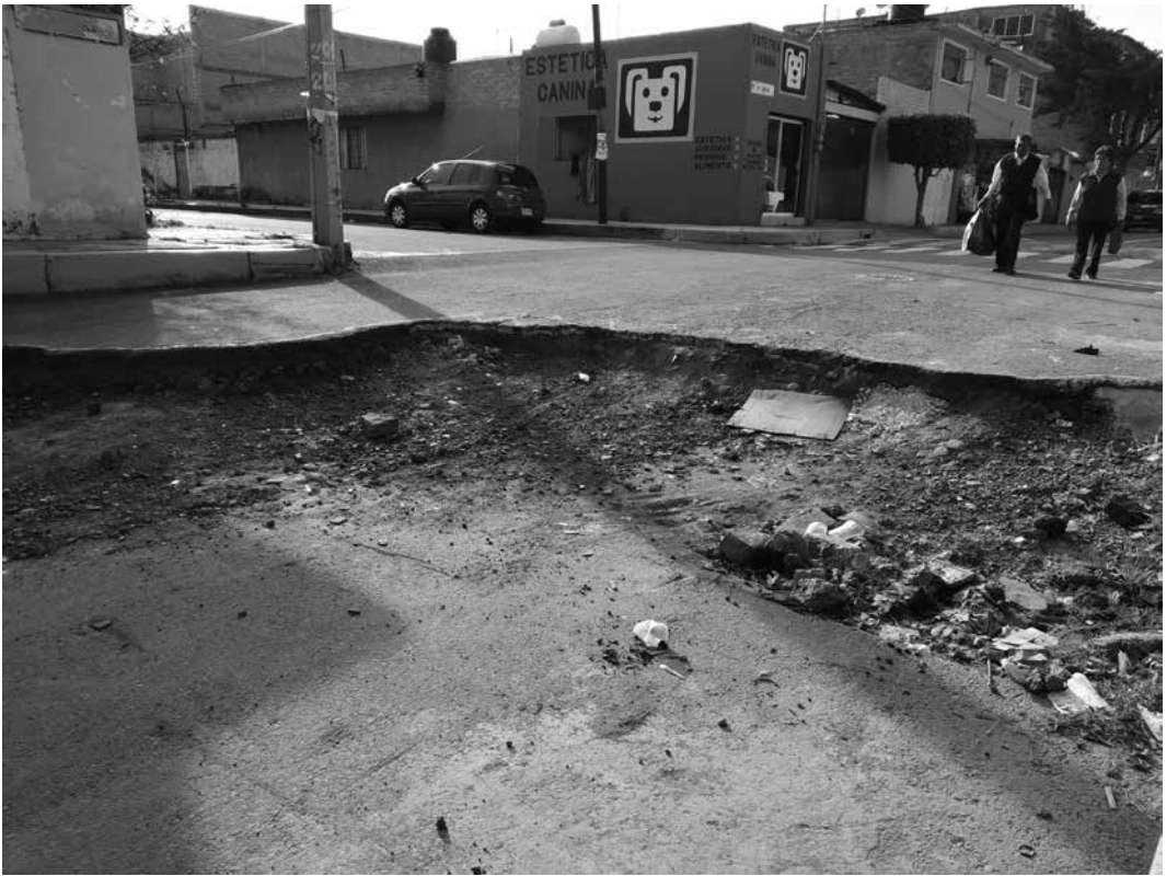
Fig. 1 – Cracked street 18 months after the earthquake.

support the proliferation and urbanization of Mexico City, and since then the region's water sector has been expanded and privatized, consequently exacerbating both environmental hazards and the exclusion of communities from access to water services (Castro, 2004; Tellman et al., 2018). In effect, there have indeed been and continue to be socioeconomic and political factors that affect vulnerability differently in various parts of the city and at different scales. Large scale disasters, like earthquakes, affect entire regions, but conditions at the local scale show disparate levels of resilience and ability to recover. In Mexico City, below-ground conditions and water provision are two important factors in recovery at the local level. Spatially and politically, water infrastructure creates a disparity of interests as it serves to both provide a resource and assist with adaptation to flooding, but simultaneously generates risk in vulnerable areas that receive fewer services and less attention when an earthquake disaster affects underground infrastructure.