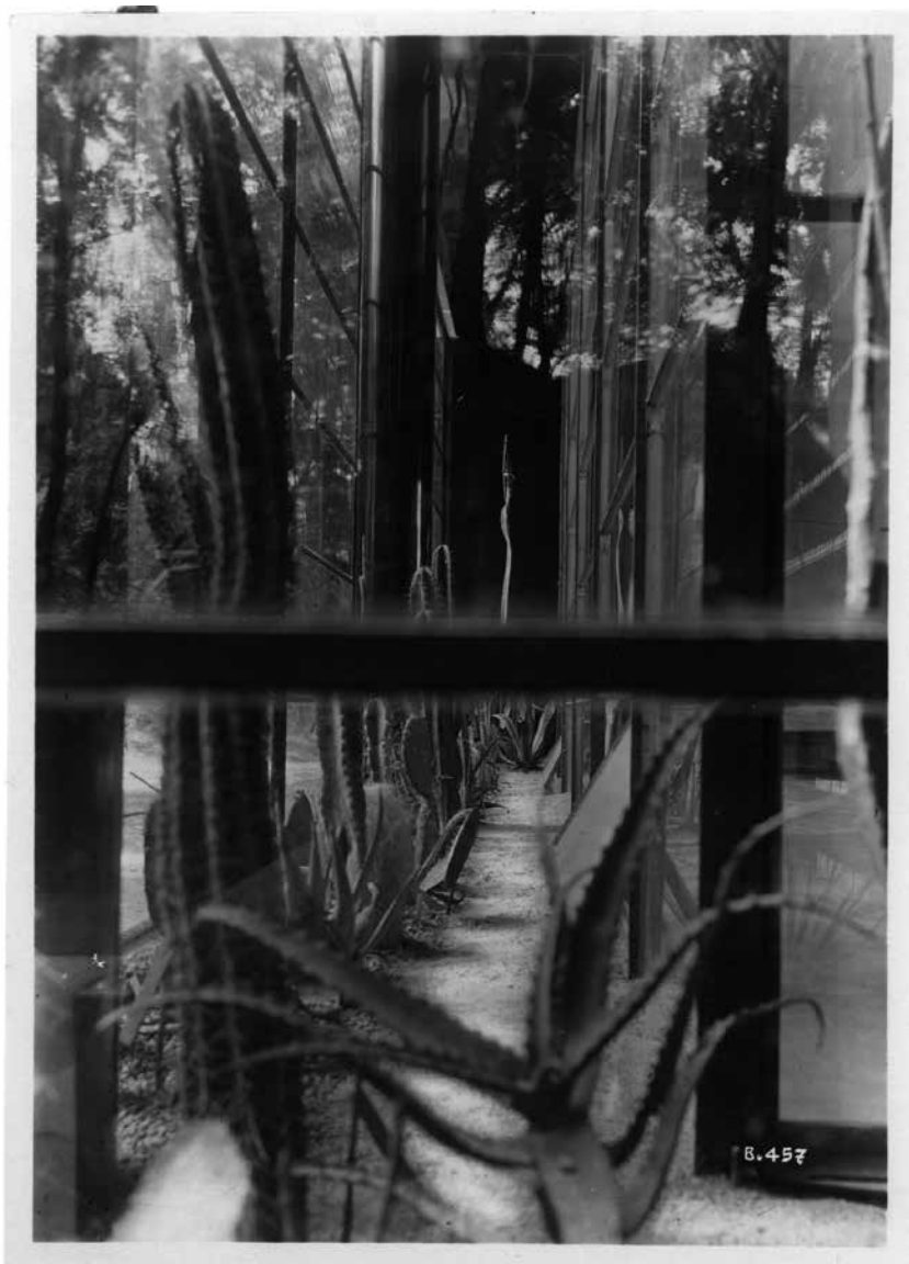
Fig. 2 -Luigi Figini and Gino Pollini, The greenhouse of "casa elettrica" [La serra della "casa elettrica"], Villa Reale di Monza, IV Triennale di Monza, 1930. TRN_IV_12_0665.