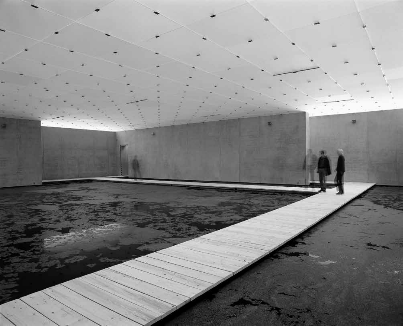
Fig. 5 - Olafur Eliasson and Günther Vogt, The mediated motion , 2001. Water, wood, compressed soil, fog machine, metal, plastic sheet, duckweed ( Lemna minor ), and shiitake mushrooms ( Lentinula edodes ). Installation view: Kunsthau Bregenz, Austria, 2001. The artist; neugerriem-schneider, Berlin; Tanya Bonakdar Gallery, New York / Los Angeles © 2001 Olafur Eliasson.