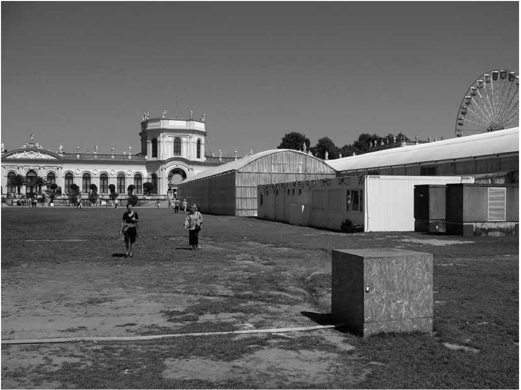
Fig. 6 - Lacaton & Vassal Architectes Karlsae pavilion for Documenta 12, Kassel, 2006. Exterior view.

hybrid-use to urban farming buildings, recent design practices point to the fact that “green does not stop at a building’s surface: it also penetrates the interior, to give the impression of living everywhere with nature” (Zardini, Borasi, 2012: 19).