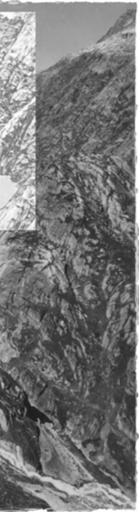
Lake Grimsel: "Grimsel" (Peter Liechti, CH 1990)

economic refugees, because of too much economic wealth, not too little? That's the new paradox. It is an interesting process that's occurring today. We are creating more and more artificial nature for ourselves [...]. And to build and run all this artificial nature, we have to curb and destroy more and more genuine nature. That is an interesting process." The expansion project Grimsel West was finally suspended at the end of the 1990s due to strong opposition. Maybe Liechti's documentary might have contributed to this outcome. However, within the contemporary context of the growing need of renewable energy, construction of the Spitalamm gravity dam has begun in 2019 to replace the first dam. The project was even driven forward at the federal level by the so-called "Grimsel paragraph" (2022) and should be completed in 2025.