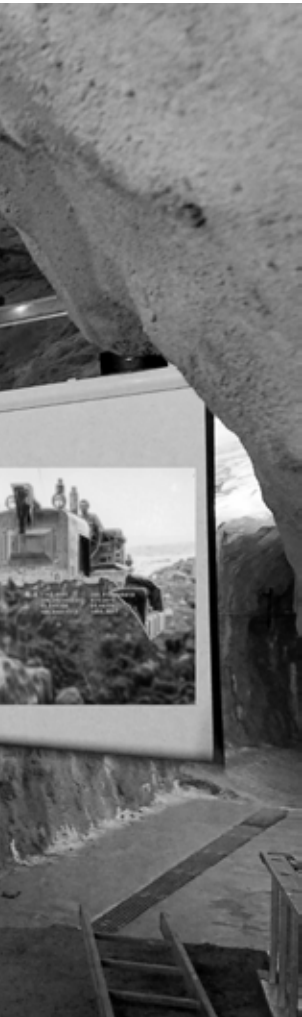
Lac de Dix: “Opération ‘Béton” (Jean-Luc Godard, CH 1955) & the mediation of hydropower

working entirely on his own initiative and therefore did not have to obey any corporation directives typical for commissioned films.