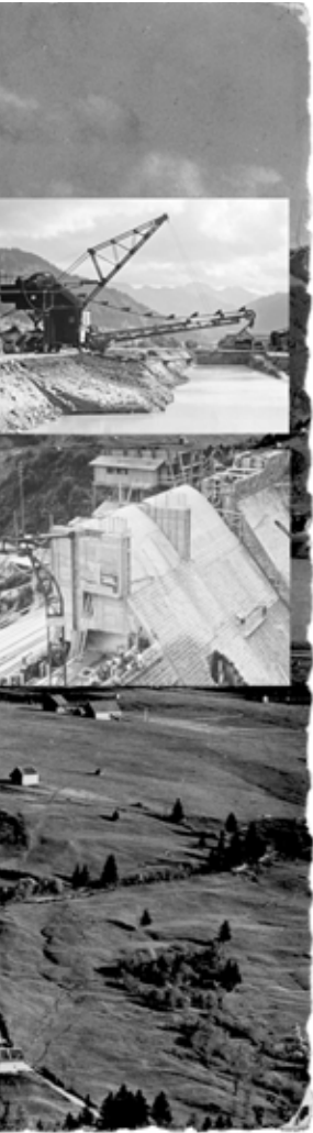
Lake Sihl: "Der Traum vom grossen blauen Wasser" (Karl Saurer, CH 1993)

started at the end of the nineteenth century. It is situated close to Einsiedeln, a well-known pilgrimage place. A monastery monk was even inspired to make a proposal, which would have also flooded his nearby village of origin. "Fellow citizens, let us not lag behind, let us in our remote mountain valley also participate in the general competition of the spiritual and physical forces of the gigantic progress and achievements of mankind. The electric spark ignites powerfully into the new century," a politician is quoted in the movie, demonstrating the people's tangible belief in and pressure for the pathos of progress.